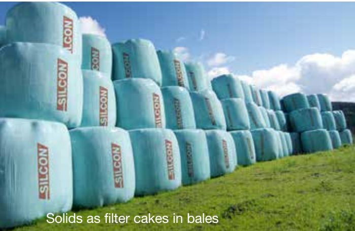
Solids as filter cakes in bales

The filtered solids are a valuable recyclable material for biogas plants. In addition, they are fertilisers for farmland that is low in nutrients, or energy sources in cement factories and power stations.