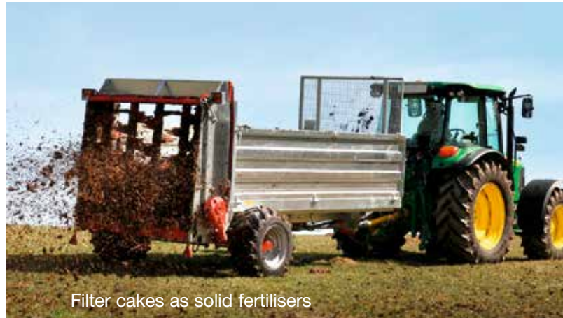
Filter cakes as solid fertilisers

It is preferable if bales weighing 1 to 1.5 tonnes are produced. Conventional balers can be used for this.