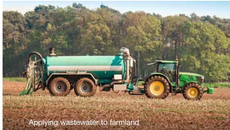
Applying wastewater to farmland

In an integrated process, the aqueous phase is separated into a microflotation plant or, beforehand, a hopper. The liquid is fed into a reactor tank. Metered addition of flocculants such as iron(III) chloride is performed here. Turbulence is generated by means of compressed air in order to improve mixing in the reactor. Consequently, the flocculating agents, phosphates, etc. link together in the suspension and rise like a foam head. The foam with the constituents is removed and gathered. This material is itself a concentrated fertiliser. The liquid is then put into tanks. At this point, microorganisms break down the nitrogen compounds.